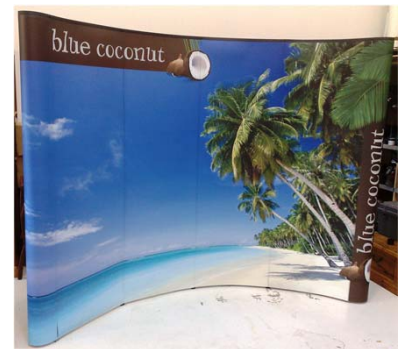
Premier POP Stand 3x4 also available

Premier Pop-Up Curved is a classic exhibition system. It is the ideal, easy-to-set-up, curved wall.