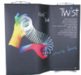
two twist and flexilink - version 1