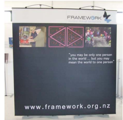
Twist available in curved or straight walls.

The Twist banner bridges the gap that exists between pop-up display systems, pole and panel, and banner stands; a system where both form and function have been specifically considered to bring flexibility, ease of use and stability.