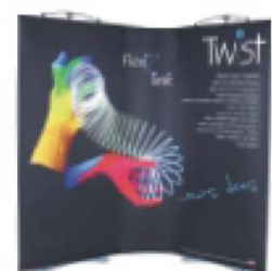
two twist and flexilink - version 2